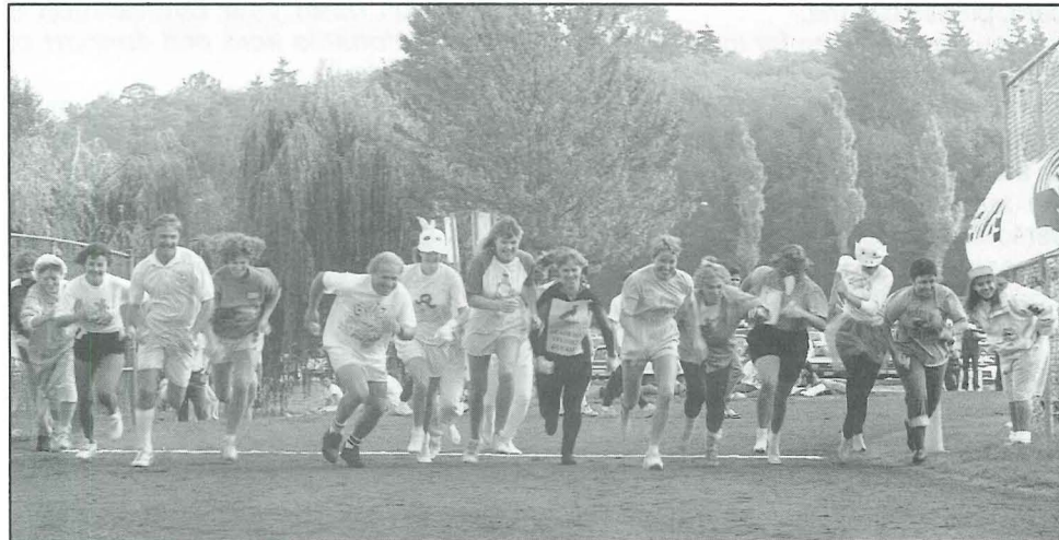
Quack-A-Thon competitors at the starting line.