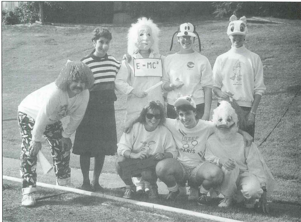
Quack-A-Thon Grand Event prize winners — Duckathletes from Personnel.