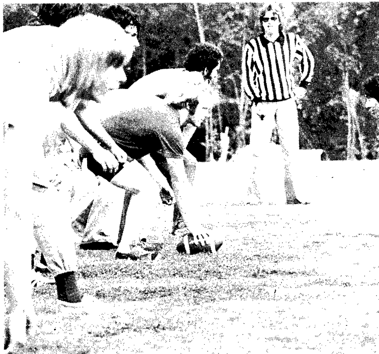
Scintillating action on the murderous all-weather field during intramural flag football action last Wednesday.

The October 17 session is not a league game. Players and teams will be set up. If you don't have a team we'll have one for you. Come out, guys and gals and have fun! If you like people you must like curling!