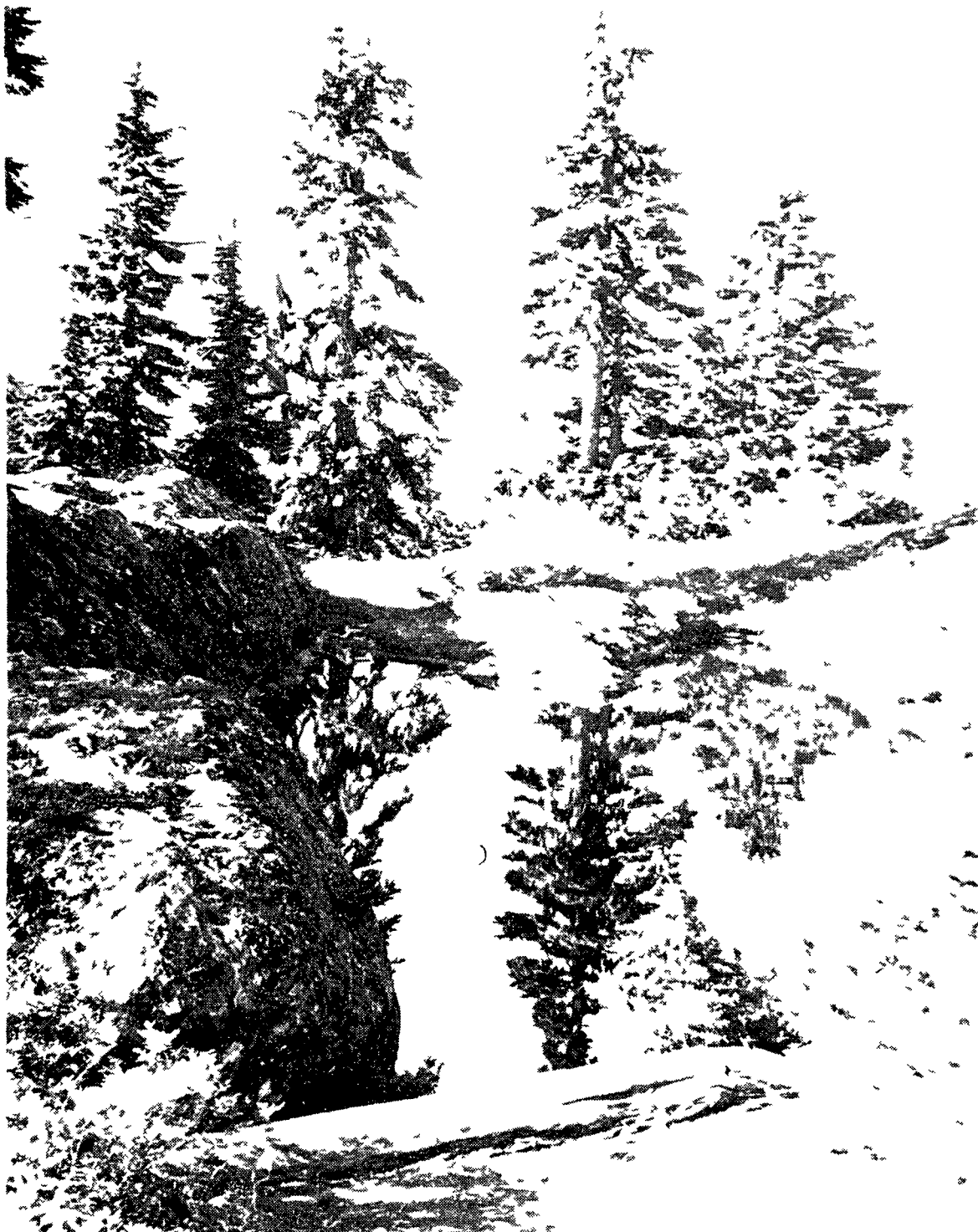
A small mountain puddle discovered by the Outdoors Club on one of their recent hikes