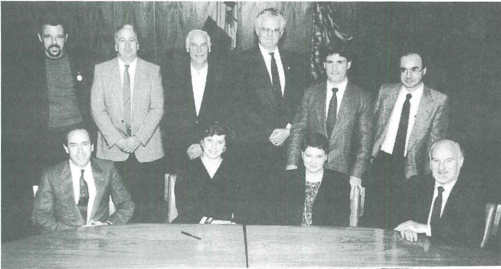
Both BCGEU locals at BCIT signed their contracts during a signing ceremony on November 28.