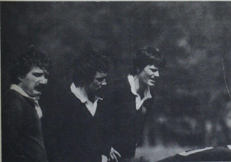
and a feeling of comradary that is not present in any other team