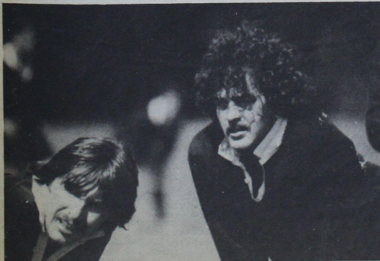
Starting Wednesday, May 6, Rugby Team members will take cash or any refundable bottles or cans in trade for tickets. They will be in the SAC each day.