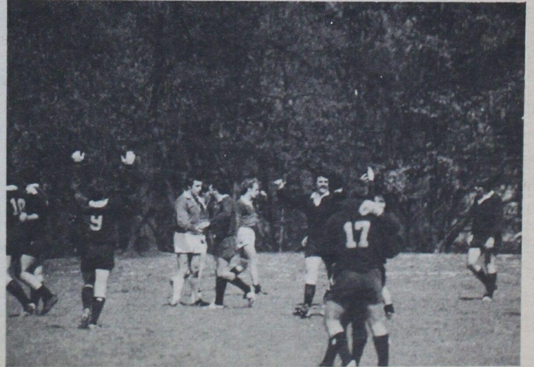
Prizes include five $10 prizes, two $50 and 1 $100 prize, as well as $25 per goal prizes. Based on the final game.