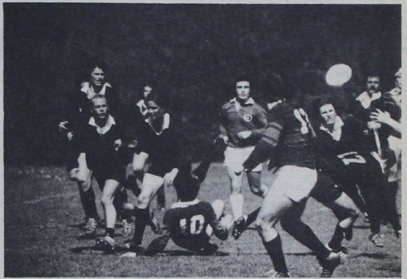
Fraser Valley 2nd Half, and the Fraser Valley Playoff Championships. They are third in the province in the 3rd