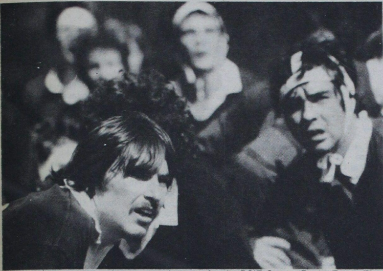
It was a good season for the BCIT Cougar Rugby Team. They have won three major tournaments: The Totem Conference, the