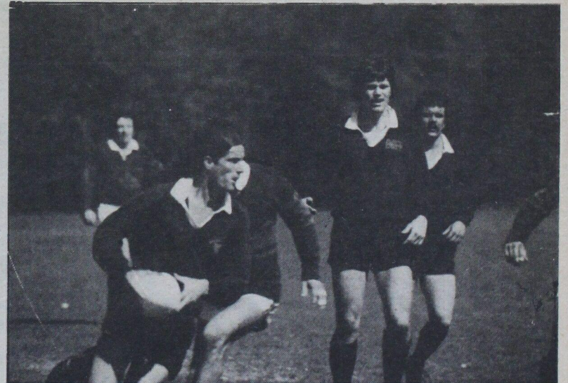
at the school - their attitude is so very important'.