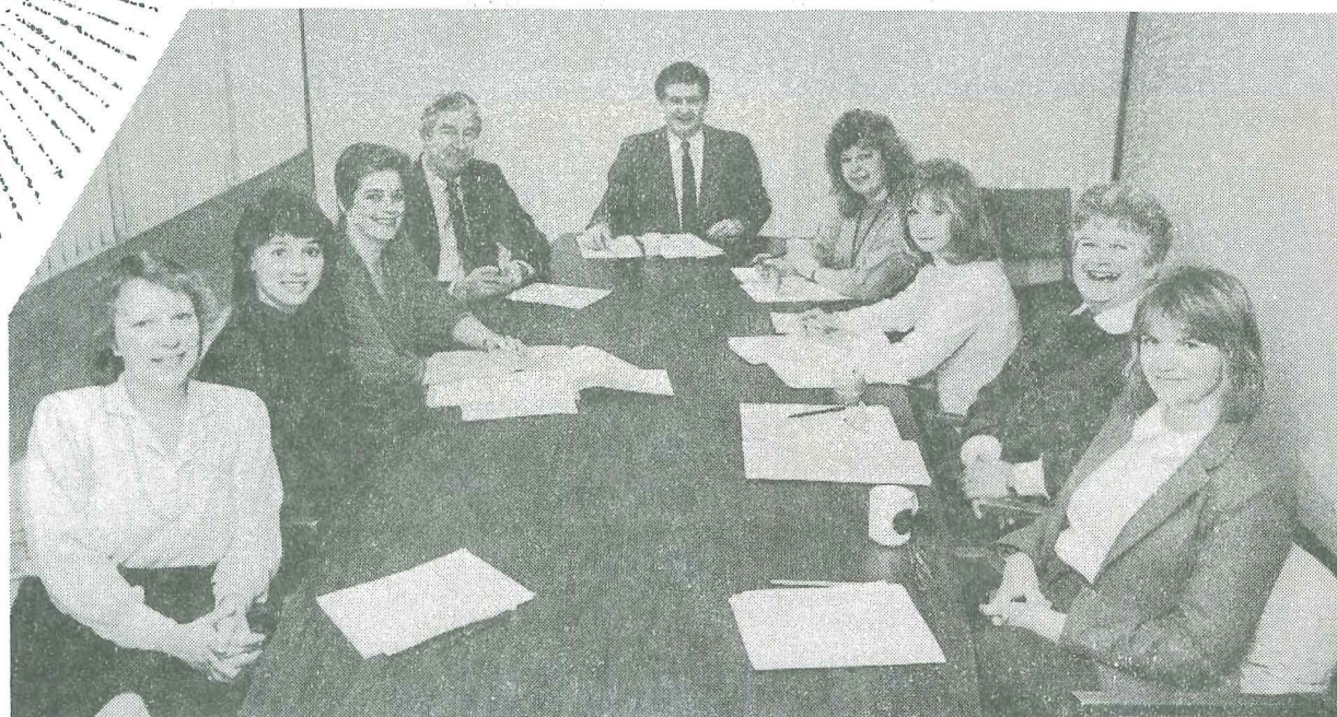
COMMUNITY RELATIONS DEPARTMENT