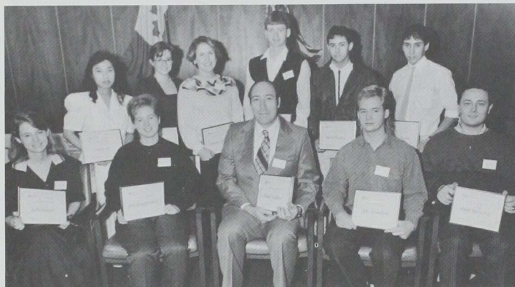
Alumni Entrance Award winners.

S.A. Publishing Office 3700 Willingdon Avenue Burnaby, B.C. V5G 3H2