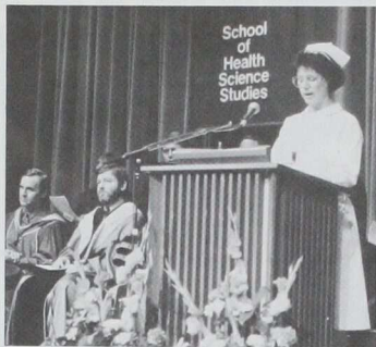
January Convocation ceremonies for General Nursing and Electrical/Electronics.

Another 92 students have experienced the thrill of graduation. 41 students from General Nursing and 51 from Electrical/Electronics completed their BCIT training in January. Best of luck to all our new alumni.