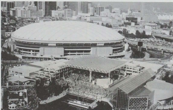
The British Columbia Club (above Waves and 86 Street) will be the setting for the 1987 Annual General Meeting on May 29. Come and see the trade Show exhibits, sip a cool drink on the club patio overlooking the Place of Nations and hear all about the latest association activities.

Underground parking is available near Stadium Gate or hop the SkyTrain.