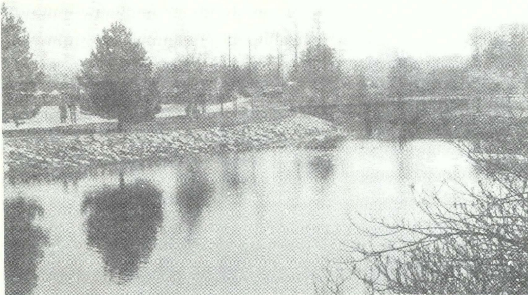
Yes, it really is spring! Last weekend's sudden snowstorm brought the chill of winter back to BCIT but by Sunday afternoon spring had returned.

Golf Shirt Awards will be available at the end of this week.