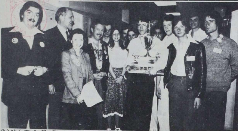
BUILDING TECH. PROUDLY DISPLAYS TROPHY WHICH THEY WON FOR BEST DISPLAY AT OPEN HOUSE

ALUMNI ASSOCIATION HOTLINE 434-5734 local 827