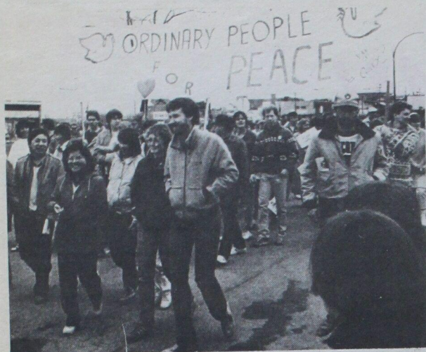
The annual Vancouver walk for Peace is this Saturday, Starting at 11 a.m. at Kitsilano Beach.