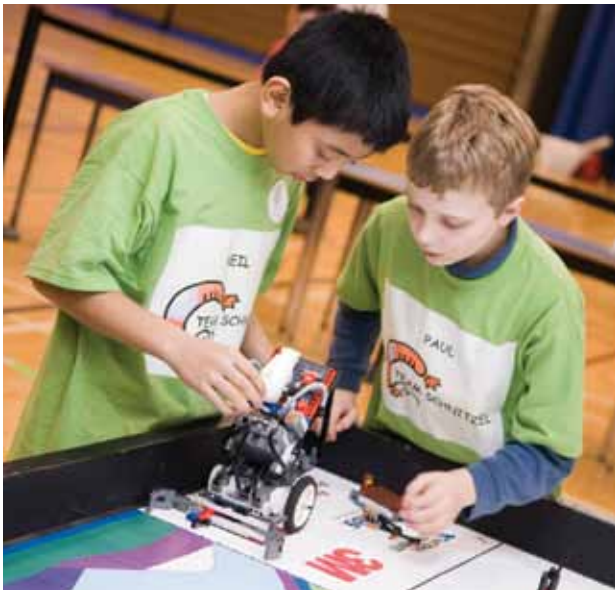
Elementary student teams put their robots into action.