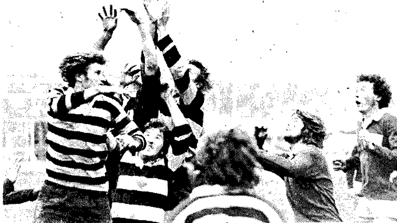
Cougars vs. Capilano: although consistently able to capture the ball in the lineouts, the Cougars