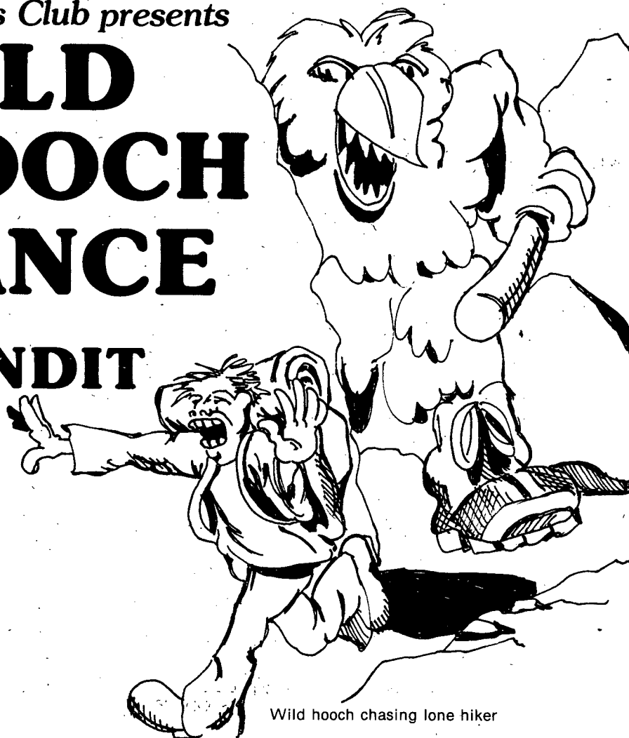
Wild hooch chasing lone hiker