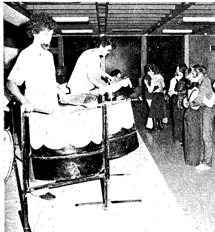
The Moonlighter's Steel Band amazed those in attendance at the Calypso night on Friday with

Open House is the traditional closet-opening where BCIT shows itself to the world at large. It has happened every two years since the school opened and it is a VERY significant event. All activities, techs and whatever's put on displays which are digested and hopefully appreciated by the taxpayers-at-large.