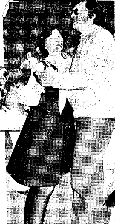
The nurses' disco on Wednesday and Calypso night on Friday last week.

Room 197 starting at 11:30 a.m. then seminar groups in rooms 270, 271, 272, 273 and 288.