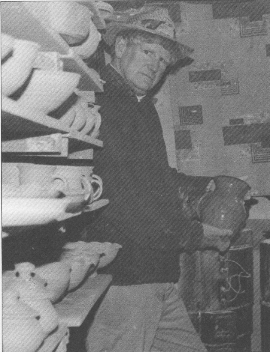
Driftwood photos courtesy of Graeme Thompson.