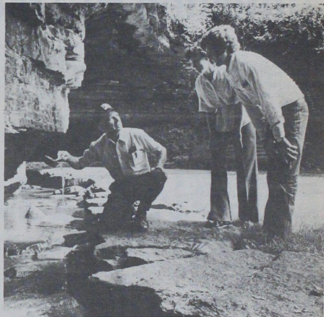
Jack Daniel Distillery. Named a National Historic Place by the United States Government