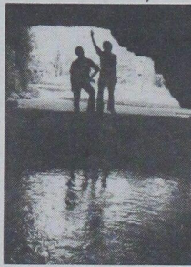
Iron-free, from an underground spring

AT THE JACK DANIEL DISTILLERY, you can taste for yourself why our whiskey is so uncommonly smooth.