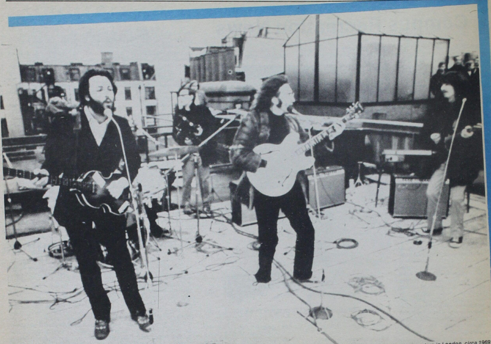
The Beatles recording 'Get Back' on the roof of Apple Headquarters in London, circa 1969.