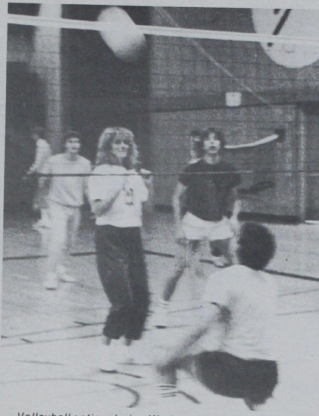
Volleyball action during Wednesday three hour break.

blue line before the puck completely crosses the line our FUNSPIEL on Nov 24th. Watch the LINK or check with