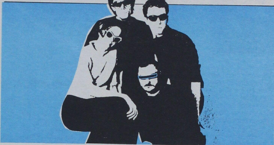
Kronos Quartet, at the Vancouver East Cultural Centre November 18.

The policy of The Link's What's On section is to print submissions of upcoming events. All submissions must be typed, double spaced and less than 50 words. Items may be dropped off at The Link or sent by mail to the managing editor. Submission deadline is Friday noon. We will not, however, print any submission from a profit organization unless the event directly pertains to the BCIT community. Please include phone numbers and any applicable graphics or photos.