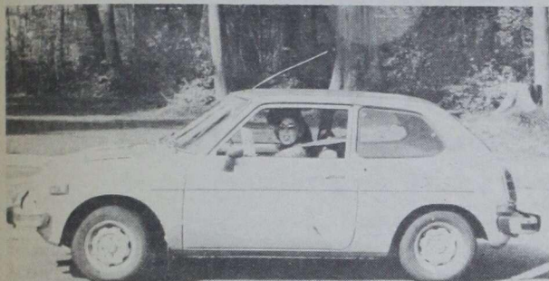
Tenth place isn't that bad.

Pete Townsend called out to the massive group of Vancouver and its people 'We'll never leave you alone again'. If he said it I believe it. They'll be back and I just have to be there. The music, the perfection, the style, the explosion, The Who!