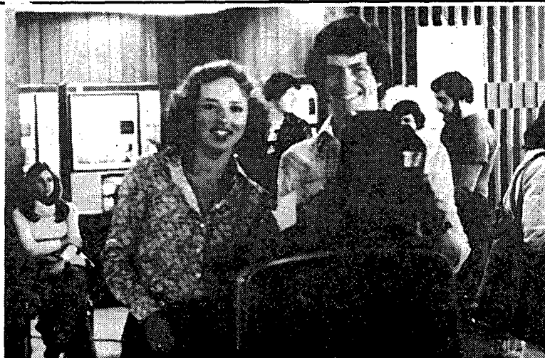
Over 3,000 students got their pictures taken for SA ID last Tuesday.

Another event featured a contest whereby two men, each with a chain saw, raced up separate logs, sawed off the top of the logs, and raced down again. What can you say about such an event? But seriously, the Forestry department must be complimented for the preparations made for the display, which, although not as exciting as the Grey Cup, did not lack for beer.