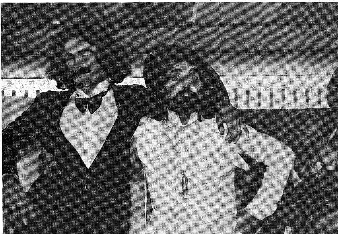
The Heartaches Razz Band performed before a "standing room only" crowd in the SAC Wednesday afternoon. By combining magic, comedy, music and well-organized confusion, they produced a show that was extremely entertaining. Well, you just had to be there. Vancouver based, the Heartaches Razz Band has just returned from touring the Maritimes and taping a TV special in Toronto. Although the band has been around for seven years, the drummer just rejoined after being a magician for the last five, so Wednesday was his first night back with the group. They are currently working on new material and will be once again touring across Canada, playing at various universities and technical schools.