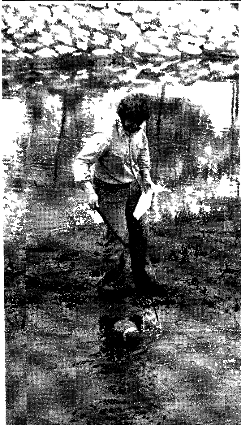
Into every lake a little football must fall. This unidentified sports fan is not diving for water [if he was he was very successful] He eventually got it out.