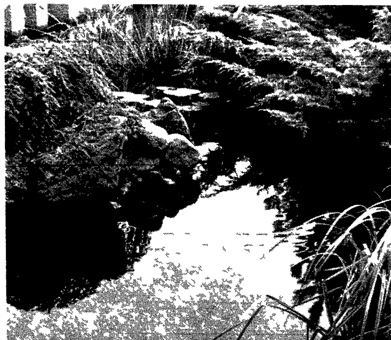
A tranquil garden scene shot by Gunter Schlieper while meditating during a recent hectic field trip