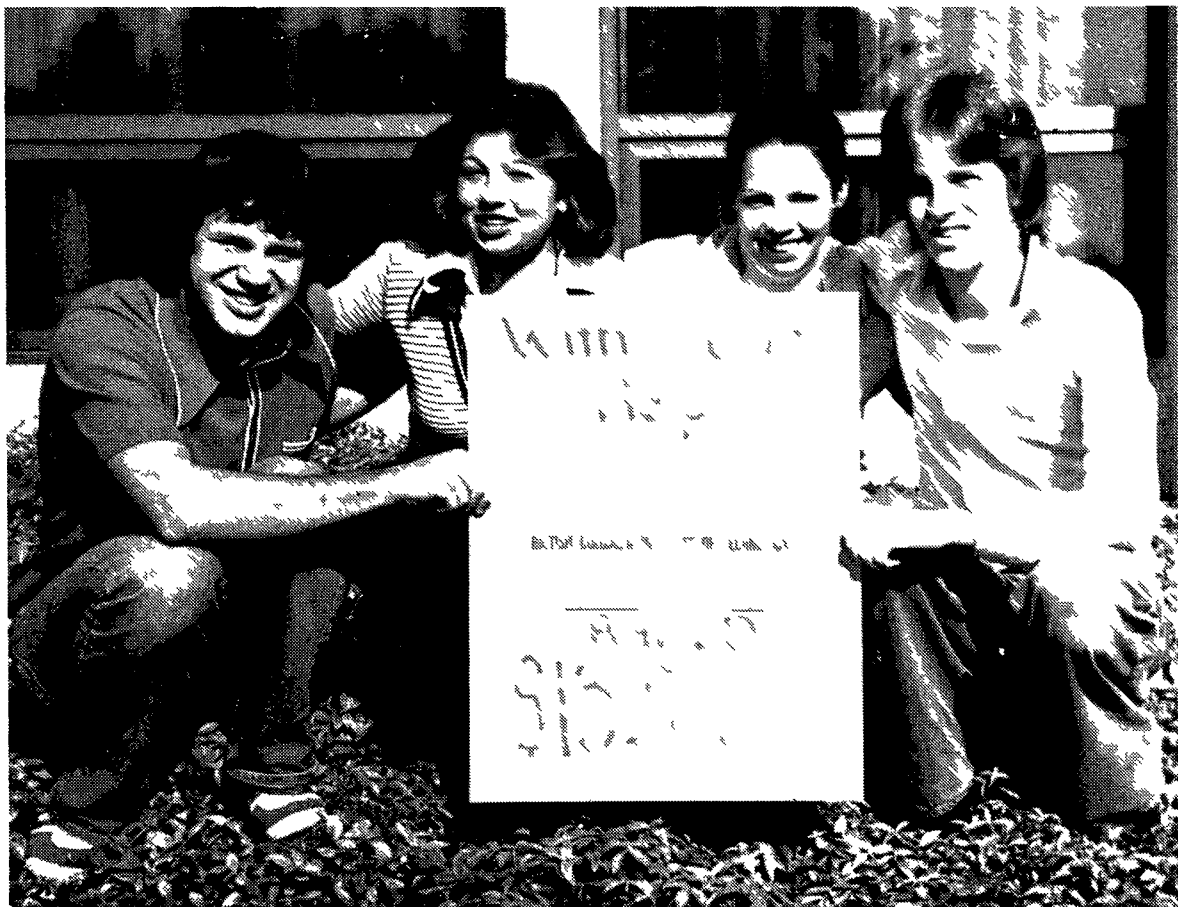
The people who did the big organizational job on Shinerama