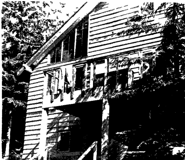
Whistler Lodge scene of winter enjoyment and spring summer

and fall personality conflicts.