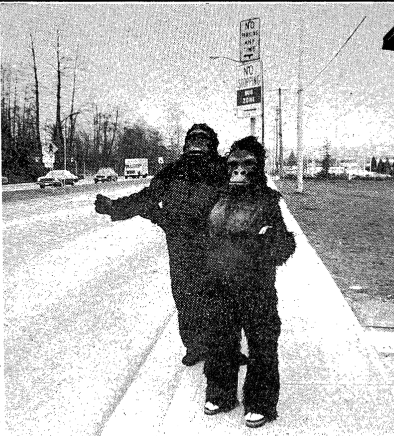
Although aping hitchhikers, these Marketing students were just monkeying around last Friday. The pair were severely beaten by two senior citizens who thought they had nabbed Human Resources Minister Bill Vander Zalm and his Executive Assistant. Most just thought they were BCVS students, so they didn't get a ride.

The Fair is open to the public and free as well.