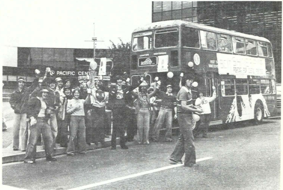
More than 500 BCIT students will be covering the Greater Vancouver region Sept. 26 in a one-day blitz to shine shoes and raise money for research into the crippling disease of cystic fibrosis. Organizers of Shinerama '79 are hoping to raise more than $15,000 for the Canadian Cystic Fibrosis Foundation. To encourage student participation in the money-raising event, all lectures will be cancelled.