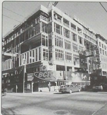
The new Downtown campus at the beginning of March 1996